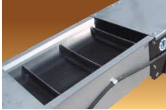
Cleated belt with 2" high cleats every 9"